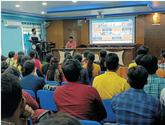
Skill Development and Placement by TATA STRIVE