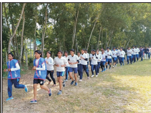
Students of Phy. Education