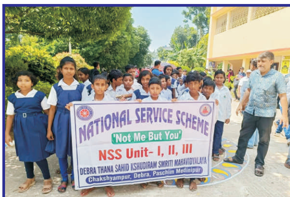
Madhabpur primary school children in our college to attend Saraswati Puja pritimhoj.