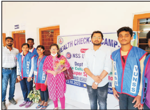
Plantation Programme & Health Check-up camp by NSS units of Debra Thana S.K.S. Mahavidyalaya