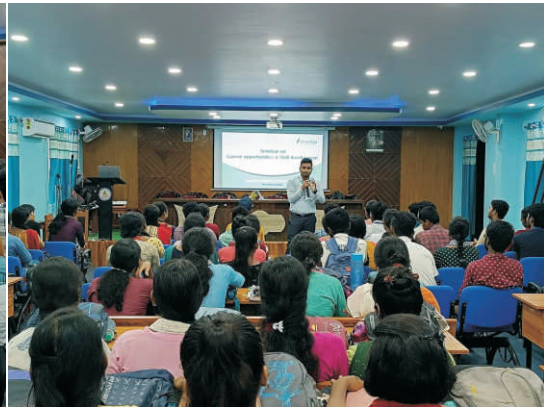
Training & Placement initiative by Anudip Foundation