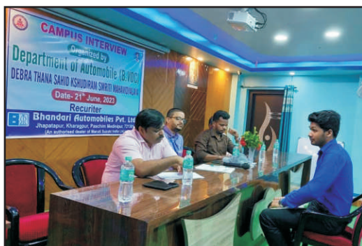
Campus Interview organised by Dept. of Automobile