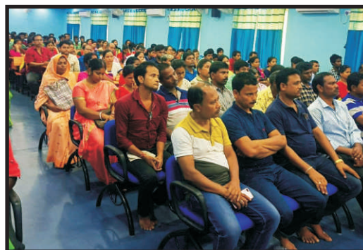
Parent Meet Organised by DTSKSM in December, 2022