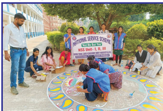
Creative drawing by our NSS Volunteers