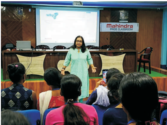
Classes by Mahindra Pride Classroom Soft Skill & Personality development of girl students.