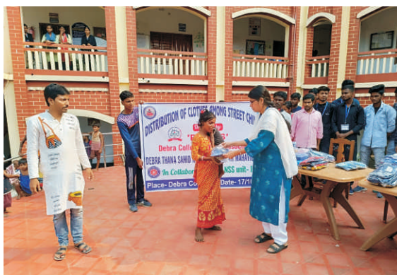
Cloth distribution to street children by alumni association