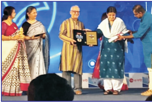
Zee 24 Ghanta Education Excellence award

सेवा प्रकल्पे सेरा डेवरा कलेज निज्ज संवादानता मेदिनीपुर जातीय सेवा प्रकल्प (A-N-19-03) दर थोकें डालाजाने प्रशासन कर्तार अना कलेज अखेरे पुरस्कार पाछे देवरा कलेज। विद्यापीठ विद्यापीठाखेरे अर्धे कालावधिमे 'डाला' अर्क कलेज पुरस्कार ह्ये। पुरस्कार कलेज विद्यापीठाखेरे अर्धे कालावधिमे 'डाला' अर्क कलेज पुरस्कार ह्ये। पुरस्कार कलेज विद्यापीठाखेरे अर्धे कालावधिमे 'डाला' अर्क कलेज पुरस्कार ह्ये।