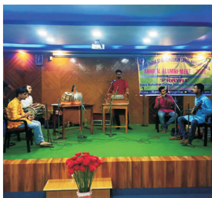
Cultural programme by Alumni Association