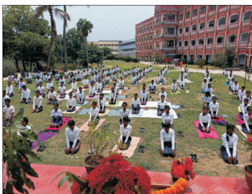
Celebration of Yoga Day