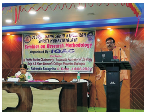
Seminar on Research Methodology