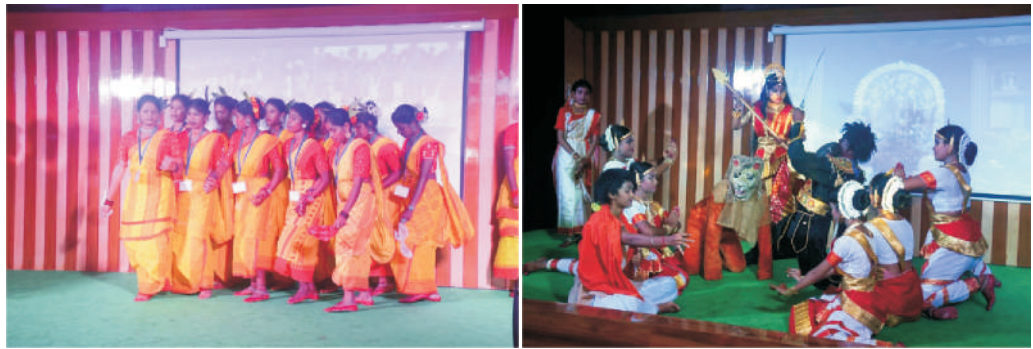
Cultural Programe during NAAC visit