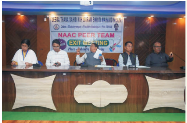
Some glimpses of NAAC visit on 18 th -19 th October, 2022